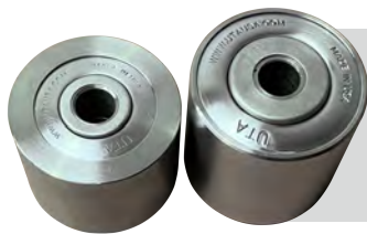
UTA Custom Designed Roller Turn Rolls *Patent No.: US 9,169,080 B2* -Lubricated for Life with CSL -These super-heavy duty capacity, ZERO maintenance, units are designed for a wide range of temperatures up to 660°F.

Cobra Blue - (ferritic nitrocarburizing) offers exceptional corrosion resistance to treated bearings where corrosion is a concern. Cobra Blue used with standard steel bearings may be an alternative solution.