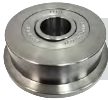
UTA Flanged Conveyor Wheel -Lubricated for Life with CSL -Used in Food Processing Equipment

Cobra Blue - (ferritic nitrocarburizing) offers exceptional corrosion resistance to treated bearings where corrosion is a concern. Cobra Blue used with standard steel bearings may be an alternative solution.