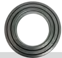
Cobra Blue Bearing (Wheel) Lubricated for Life with CSL