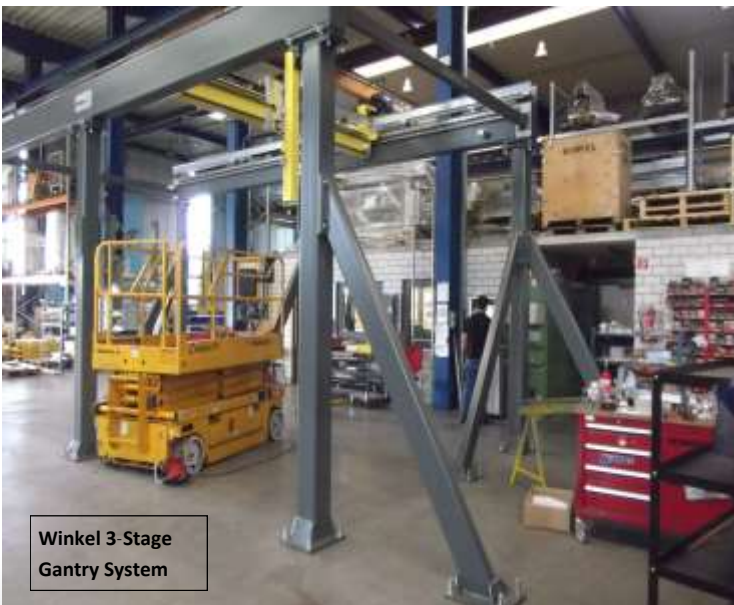
Winkel 3-Stage Gantry System