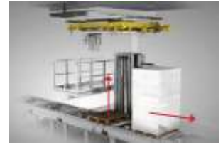
Conveying Goods to Shipping