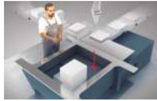
Packages Can Vary in Size