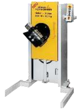
Vertical Lift & Rotational Positioning