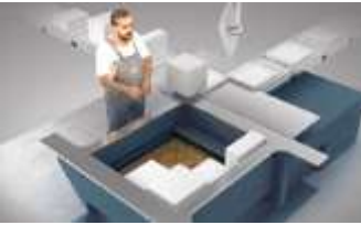
Upper Level Packing & Staging