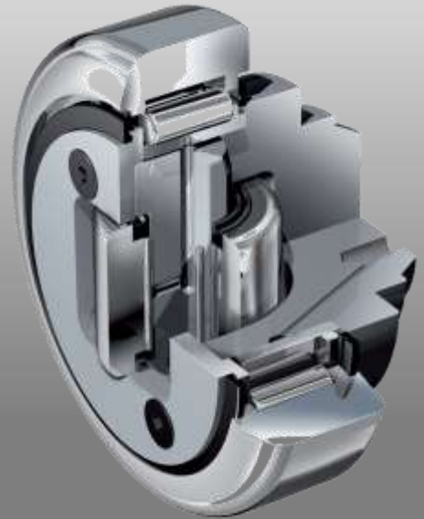
Combined Radial and Axial Bearing

Optional coatings for Combined Bearings and Profiles for harsh environments. Drilled and tapped holes in profiles are also common custom requests for mounting.