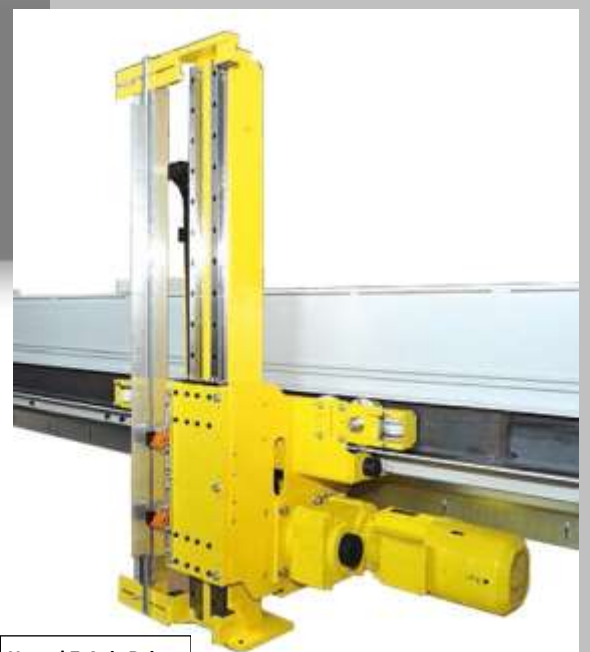
X- and Z-Axis Drive