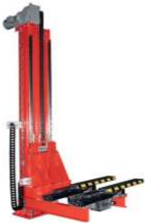
Vertical Lift, Telescoping Bed