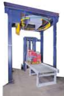
Packing & Shrink Wrapping