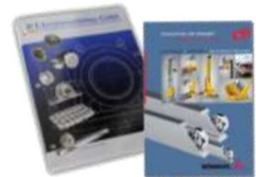
PTI and Winkel Catalogs: 800+ pages of Metric & Linear Motion PT Products from stock