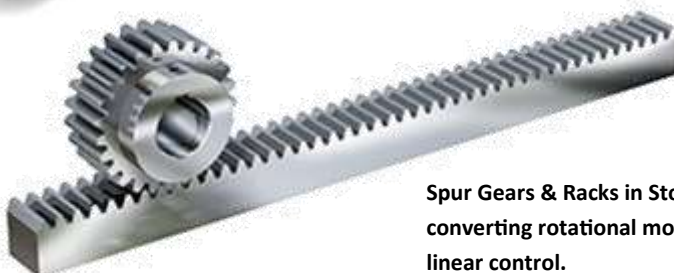
Spur Gears & Racks in Stock for converting rotational motion to linear control.