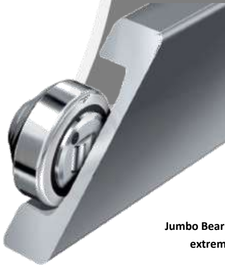
Jumbo Bearings for extreme loads