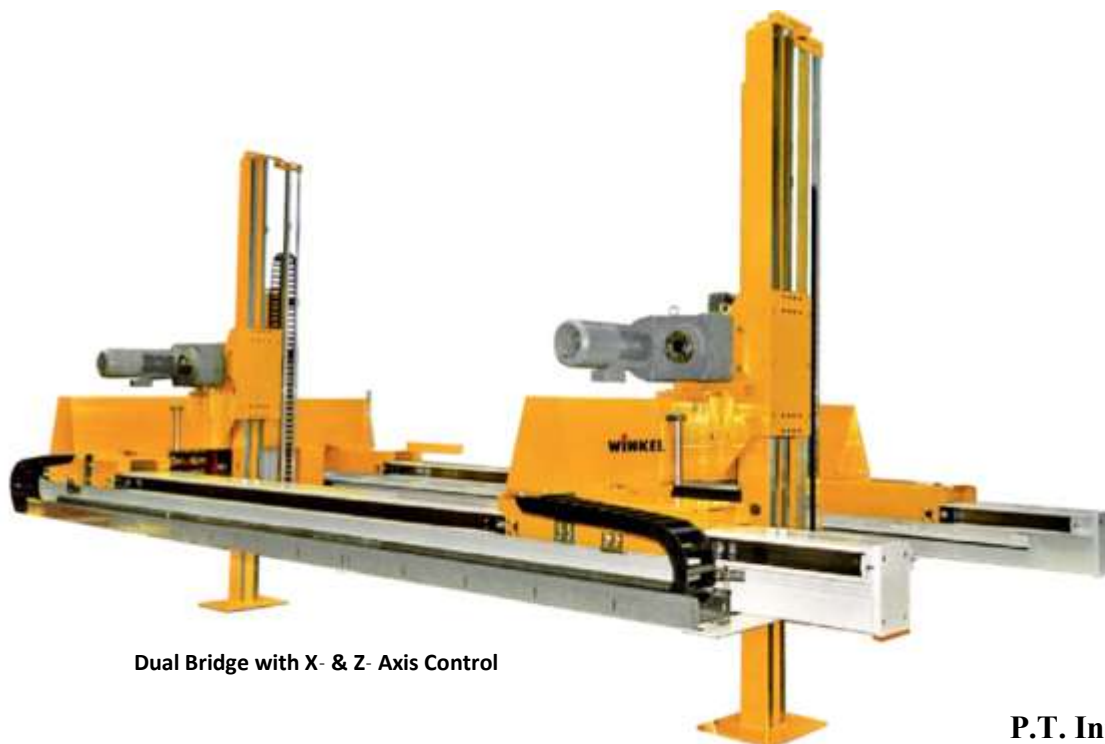
Dual Bridge with X- & Z- Axis Control