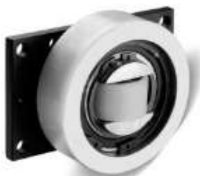
Vukollan and Polyamide rollers for quiet, high speed operation