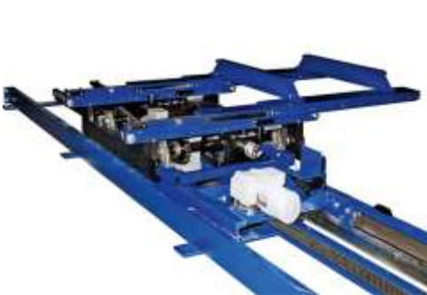
Horizontal X-Axis Positioning, Telescoping Y-Axis