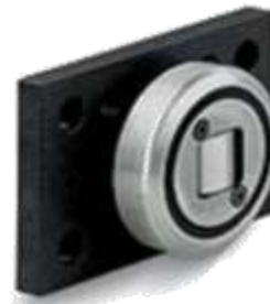
Combined Bearings with Flange Plates for quick mounting