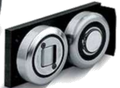
Duplex Adjustable Units allow precise radial control