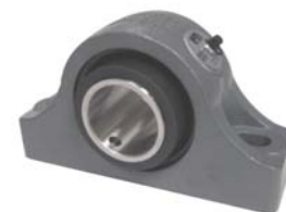
2-Bolt Pillow Block

Chart 3 & 4 provide lubrication guidelines based on operating conditions. Re-lube intervals are better determined by experience. A slight amount of purged grease at the bearing seals is normal and helps keep contaminants out of the unit. Monitor and record re-lubrication intervals.