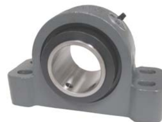
4-Bolt Pillow Block